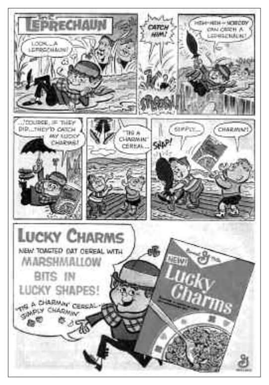
Cereal content: a comic book ad from 1964.

sees or hears hundreds of advertisements every day and from an early age learns to associate products with positive imagery and messages. Clearly, if advertising were not effective, businesses would not spend 1 percent of the gross world product to sell their wares, as they do. And they are right: studies have demonstrated that advertising indeed encourages certain behaviors and that children, who have difficulty distinguishing between advertising and content, are particularly susceptible. As one U.S. National Academy of Sciences panel found, "food and beverage marketing influences the preferences and purchase requests of children, influences consumption at least in the short term, is a likely contributor to less healthful diets, and may contribute to negative dietrelated health outcomes and risks among children and youth."34