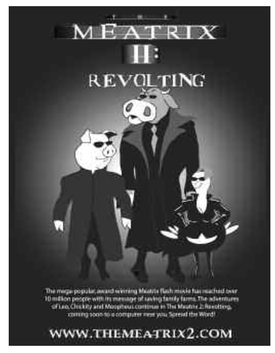
Back for more: Factory farm freedom fighters from The Meatrix II.

The clearest example of this is transportation. Reorganizing infrastructure to support walkable neighborhoods and public transit could lead to a dramatic reduction in road transportation—which pollutes locally, contributes about 17 percent to total greenhouse gas emissions, and leads to 1.3 million deaths from accidents each year. The centrality of